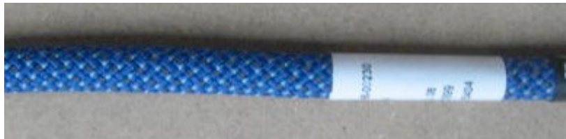
9.5mm Pinnacle – Blue

Products purchased from February 2007 thru June of 2008